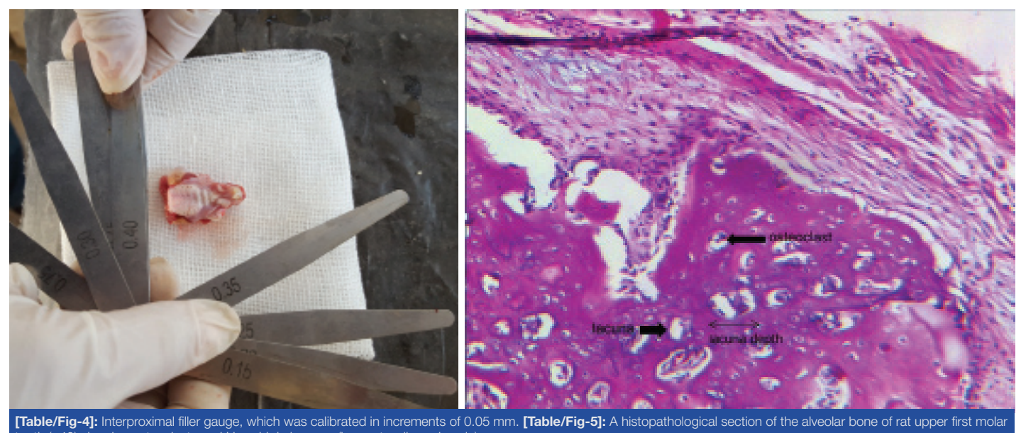
th (×40) showing osteoclasts and Howship's lacunae (haematoxylin and eosin).